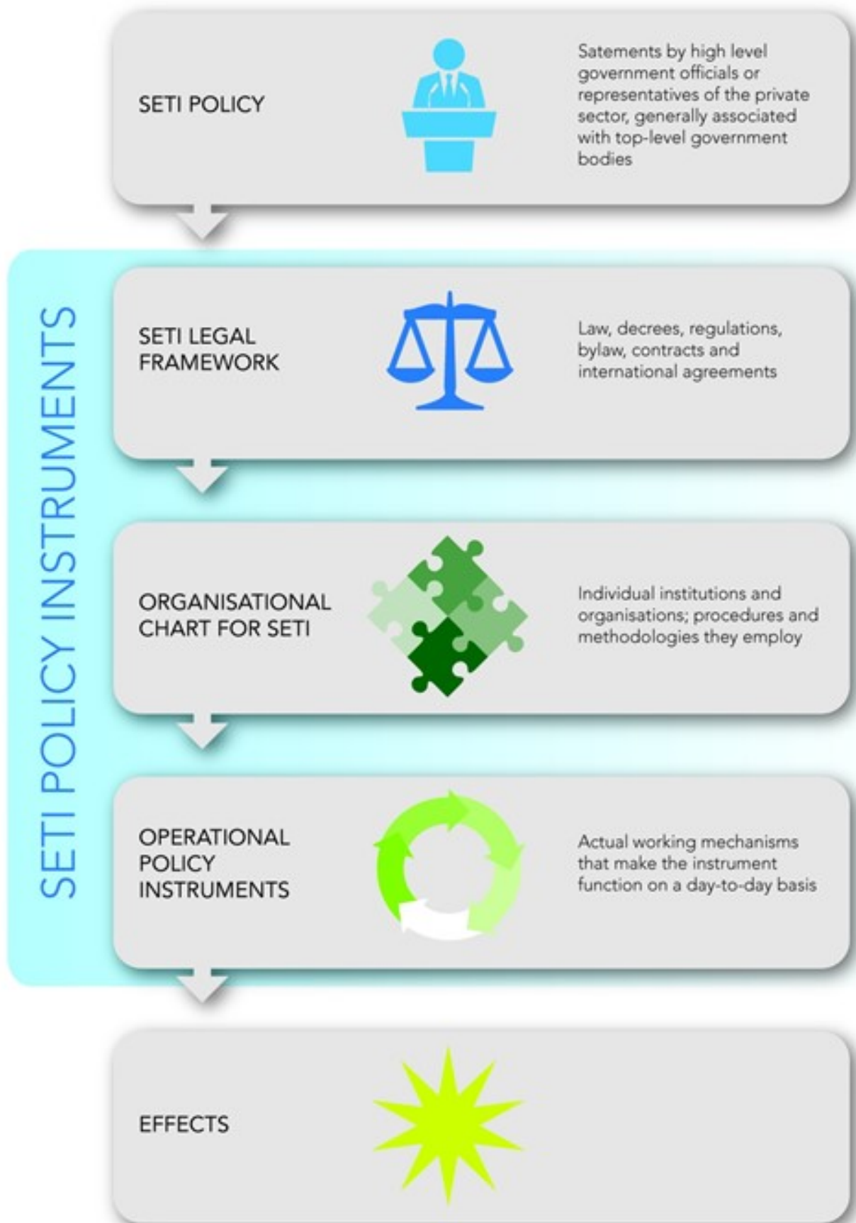
Figure 1: GO→SPIN Analytical Units